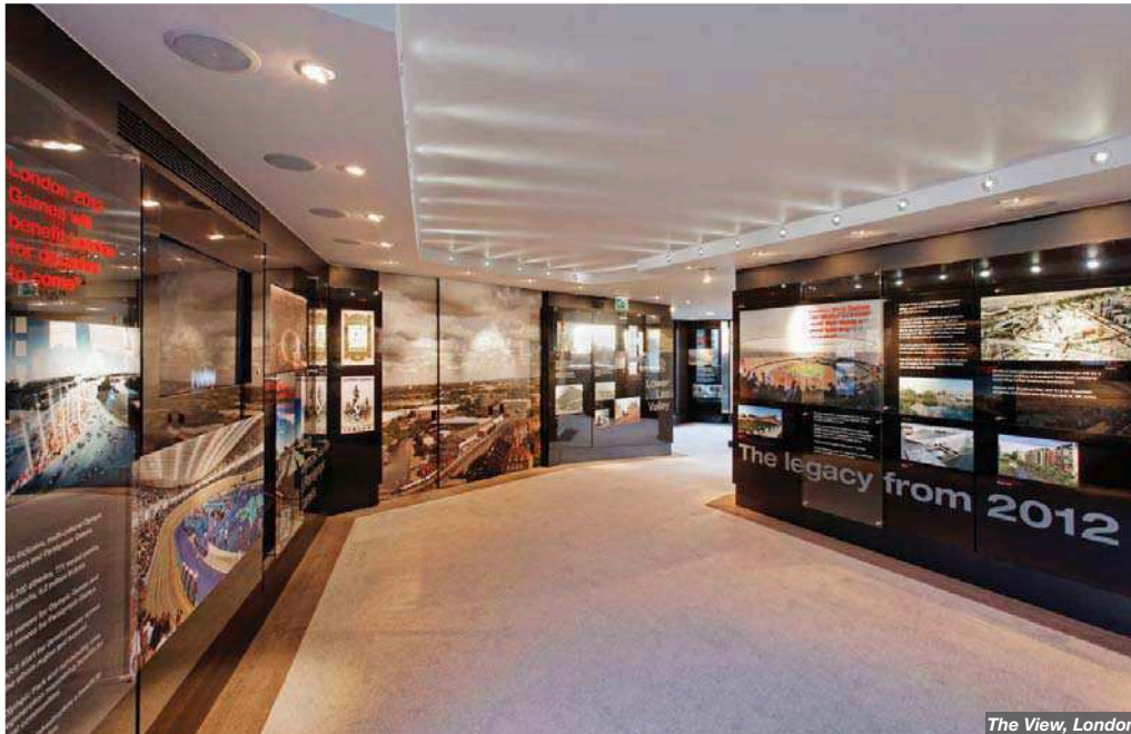
The View, London

When it comes to designing headquarters and office space, MCA know the best ways to unlock attractive environments where people really enjoy working.