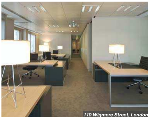
110 Wigmore Street, London