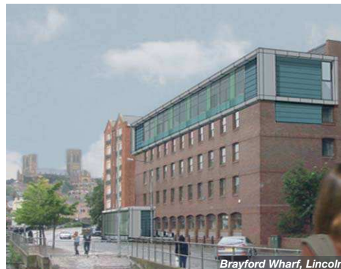
Brayford Wharf, Lincoln