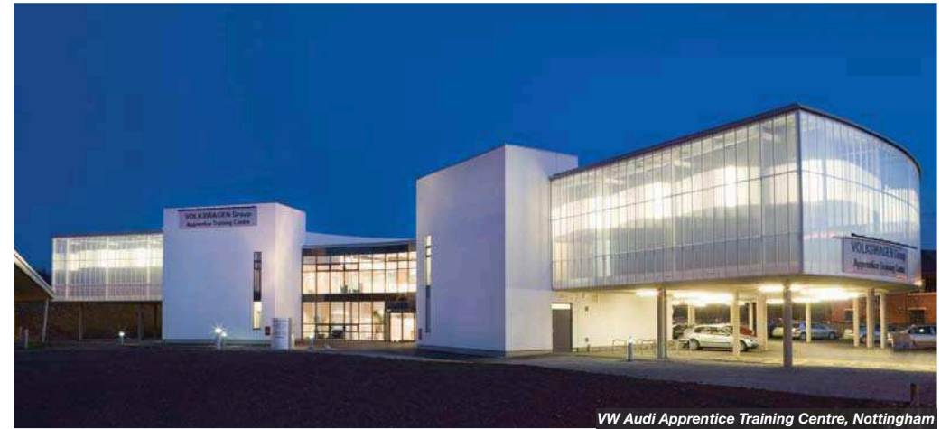
VW Audi Apprentice Training Centre, Nottingham