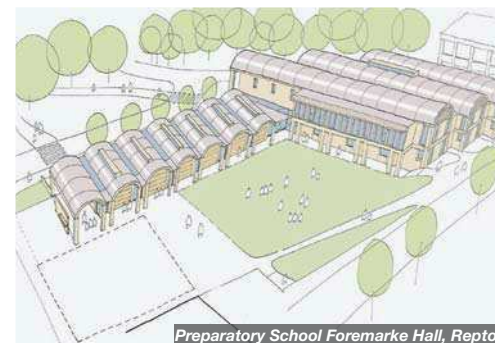
Preparatory School Foremarke Hall, Repton