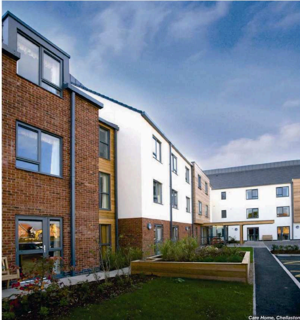
Care Home, Chellaston

MCA makes homes that people really want to live in, whether it's a town house with garden views or an apartment in an urban setting.