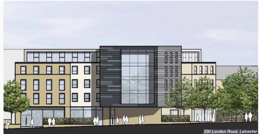
230 London Road, Leicester