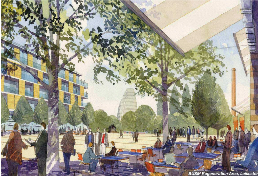
BUSM Regeneration Area, Leicester

With the wider picture in mind, MCA's skill in master planning means it is helping to regenerate, rejuvenate and expand cities and towns all over the UK and abroad.