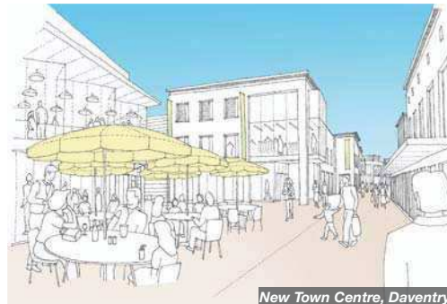
New Town Centre, Daventry