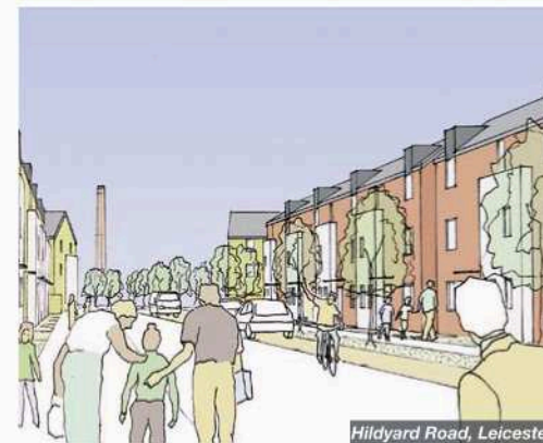
Hildyard Road, Leicester