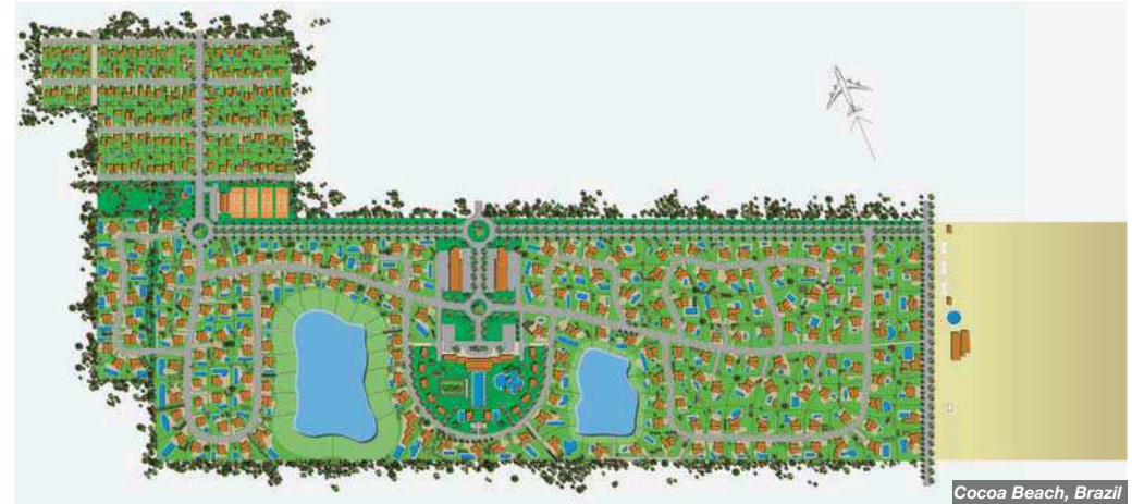
Cocoa Beach, Brazil